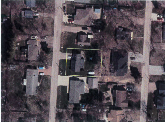
Photo Date: 2024-NOV-14 PLAN OF SURVEY. Boundary may not line up with aerial photo.