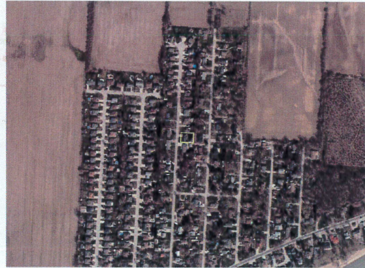
Photo Date: 2024-NOV-14 PLAN OF SURVEY. Boundary may not line up with aerial photo.

Maps and photos are provided as a courtesy only and the municipality makes no warranties as to the accuracy of this information. Boundaries on aerial photos may be skewed.