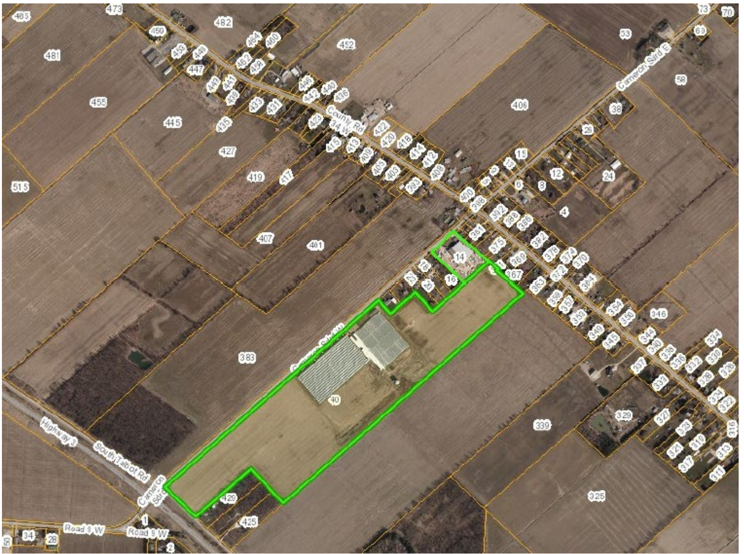
ROAD ALLOWANCE BETWEEN LOTS 275 and 276 (KNOWN AS CAMERON SIDEROAD)